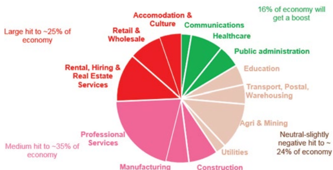
Impact to Australia's GDP from Covid-19